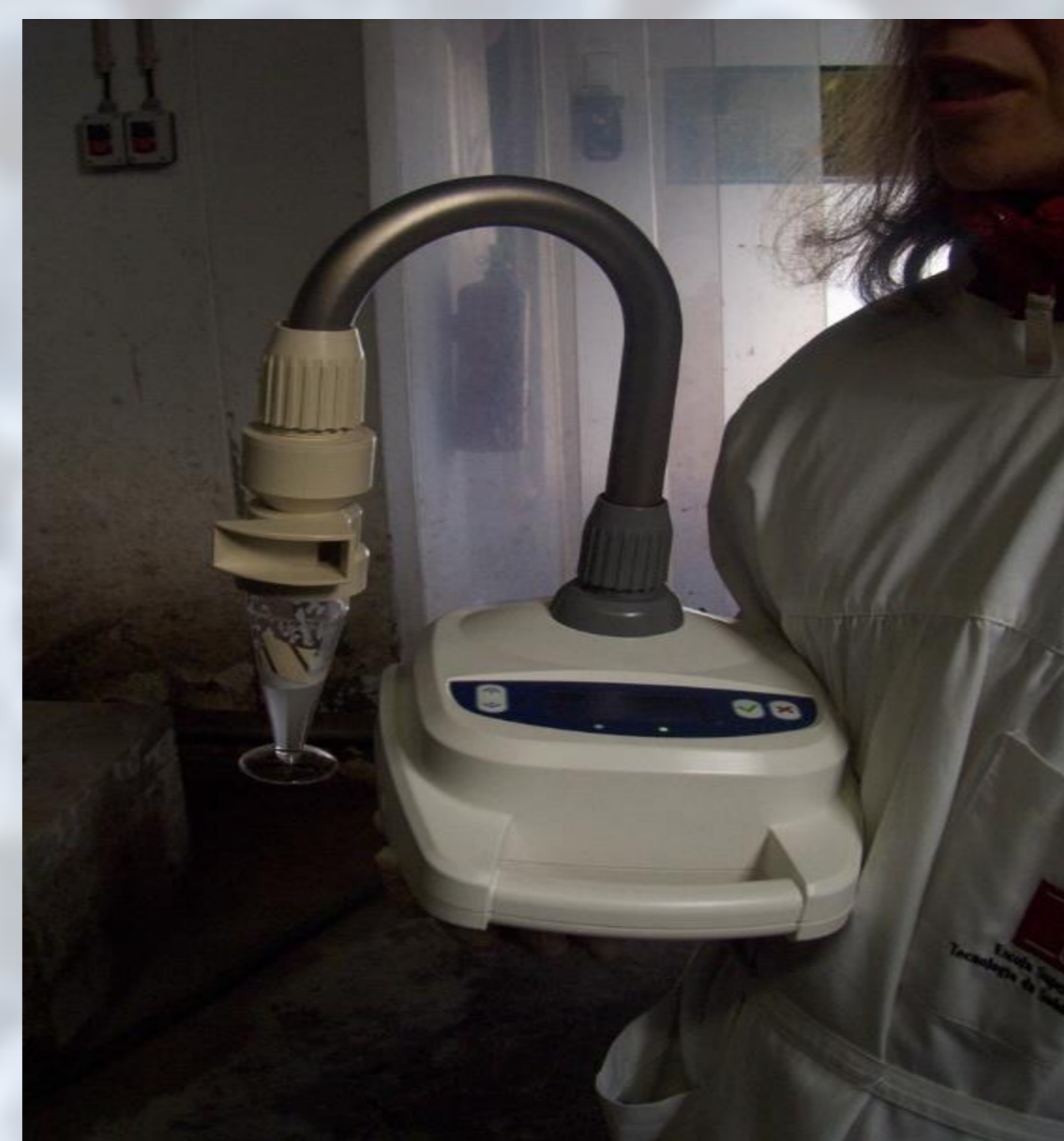
Fig. 1 - Equipment used for air samples collection to apply molecular methodologies

For molecular analysis, air samples of 250L were also collected from the same sampling sites using the impinger method. Molecular detection of Aspergillus fumigatus -complex was achieved by Real Time PCR (RT-PCR).