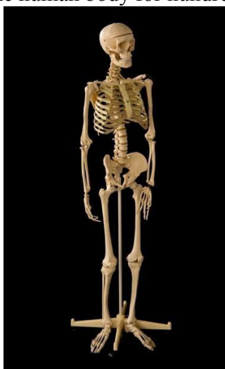
Figure 1. The human skeleton prototype

In the scope of the theoretical curricular units, the human skeleton prototype (Figure 1.), used in the Anatomophysiology and Kinesiology classes, stands out. Due to its fragile characteristics, this object has been replaced over the years. However, it is the same archetype used since the beginning of ESD. Therefore, and although the research results are still unknown, we believe that this object is still used today due to the fact that the curricular units are still taught by the same teacher and that the object clearly illustrates the characteristics and the identification of the bone system (in full-scale), which has remained the same in the human body for hundreds of years.