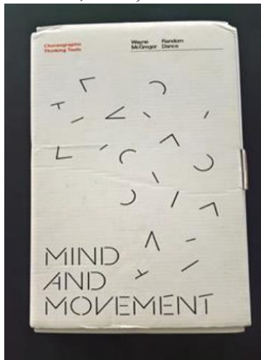
Figure 3. Box: “Mind and Movement”

methods and processes, creating a guide to convey his work (and legacy), as Almeida (2009) states “(...) to bring to surface nuances of the past that may be forgotten and sometimes are unattainable in other forms of documentation” (p.216). This tool guides the user in using the sensations and the images leading thus to different performative results from the different instructions written in the cards, creating a wide range of actions and ways of operating concerning contemporary interpretation and creation (Leach & deLahunta, 2015).