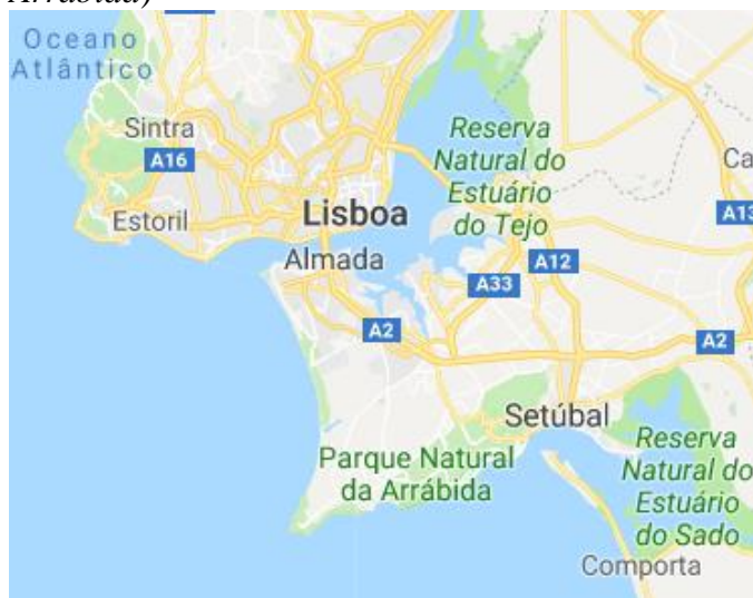
Figure 1. Localization of the Nature Park of Sintra-Cascais (Parque Natural Sintra-Cascais) and of the Nature Park of Arrábida (Parque Natural da Arrábida)

Contact with nature is an important dimension of the training of any student, independently of his/her age or cycle of schooling. As Kola - Olusanya (2005) points out, in natural places students can learn in a more integrated and contextualized way, and learn to respect Nature, also understanding the threats caused by human action, but also the positive actions taken for its preservation.