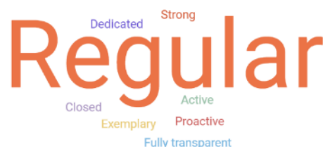
Figure 2. How would you describe your company's approach to communicating with employees during the COVID-19 pandemic?

frequent updates on the company's contingency plans and the status of COVID-19 cases within the organization. Another manager remarked that maintaining consistent communication was a priority, stating, "Internal communication played a vital role in motivating employees, promoting loyalty, and sustaining corporate culture in a remote environment."