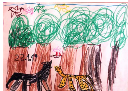
Figures 4 and 5. Two examples of children's drawings about the zoos (Room B).