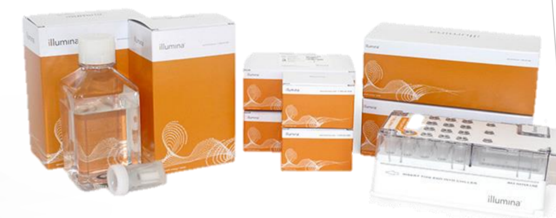
Image 2: kit TruSight One® Illumina, Inc.