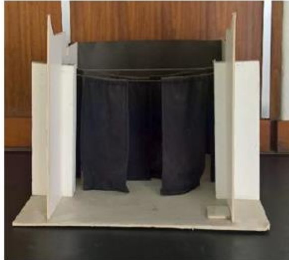
Fotografia (vista de frente)