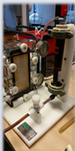
Fig. 1 - Ultrafiltration unit Rayflow

The installation was operated in i) total recirculation mode, where both the permeate and retentate streams were recirculated to the feed tank, ii) concentration mode, where only the retentate stream was recirculated to the feed tank while the permeate stream was continuously drawn, and iii) diafiltration/concentration mode, where an amount of solvent (is this case water) was added to the system equal to the permeate drawn out, Figure 2.