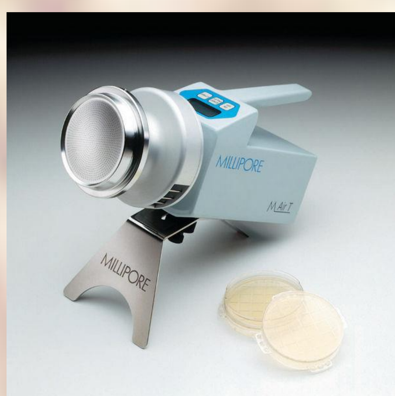
Fig. 1 - Equipment used for air samples collection

Air samples of 250L were collected through an impaction method with a flow rate of 140 L/min onto malt extract agar (MEA) supplemented with chloramphenicol (0.05%), using the Millipore air Tester (Millipore), during a work day. Surface samples, taken at the same time, were collected by the swabbing method. All the collected samples were incubated at 27°C for 5 to 7 days. After laboratory processing and incubation of the collected samples, quantitative (colony-forming units - CFU/m 3 and CFU/m 2 ) results were obtained.