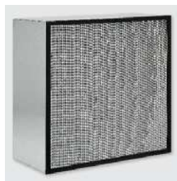
Deep Pleat particulate filter cells, type DFH, construction GAL/STA