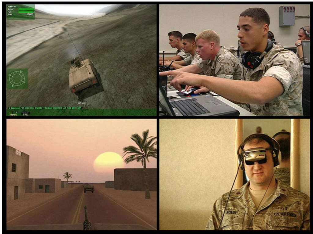
Img. 3. Harun Farocki, Serious Games - video stills.

The relationship between the psychic unconscious and the operative-image can be examined in war games used by the US army as simulators for various purposes, from training and recognition (perception and cognition) to therapeutic purposes. These display systems working-through 19 digital treatment in troops suffering from the disorder of Post-Traumatic Stress of War , thus creating an isomorphism between the phase of pre-battle training in virtual reality simulators and post-trauma therapy also through the same technologies.