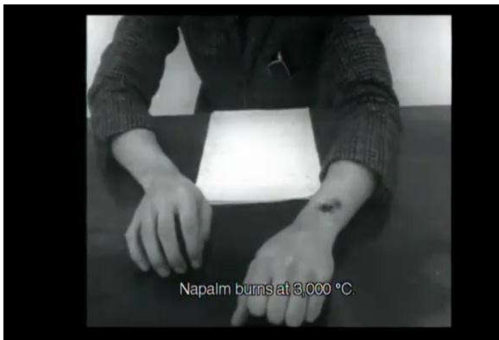
Image 1. Harun Farocki, Inextinguishable Fire (1969) - video still.

Harun Farocki is not intended to prevent or censor the violent images 6 but rather cancel the mediations produced by the market of the visible and disarm the stereotypes, the bad conscience and the defenses of visual reception; for so, says Georges Didi-Huberman, «open eyes to the violence of the world that is inscribed on the images» (2013, p. 35). In Inextinguishable Fire , Farocki prescribes another distribution of the sensible 7 when he choose to transmit the invisible speech 8 of the victim, giving to the voice «the place where it can be heard» (Mondzain, 2009, p. 71).