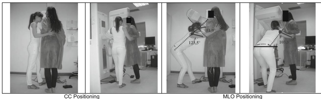
Fig. 1 Postures assumed by the radiographer with similar height compared to the patient

the patient, the breast area that the radiographer visualised was reduced, showing a tendency for the radiographers to compensate for the height difference by standing on their tiptoes [1]. Both legs remained extended and the left foot placed on the compression foot pedal.